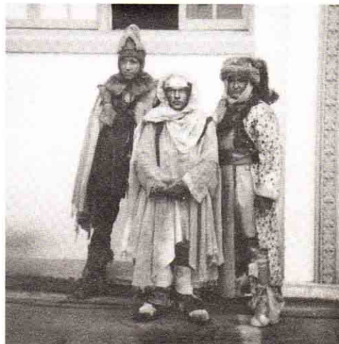
Former CINEMAPOLIS employees dressed for the big time as extras in Star Trek VI .